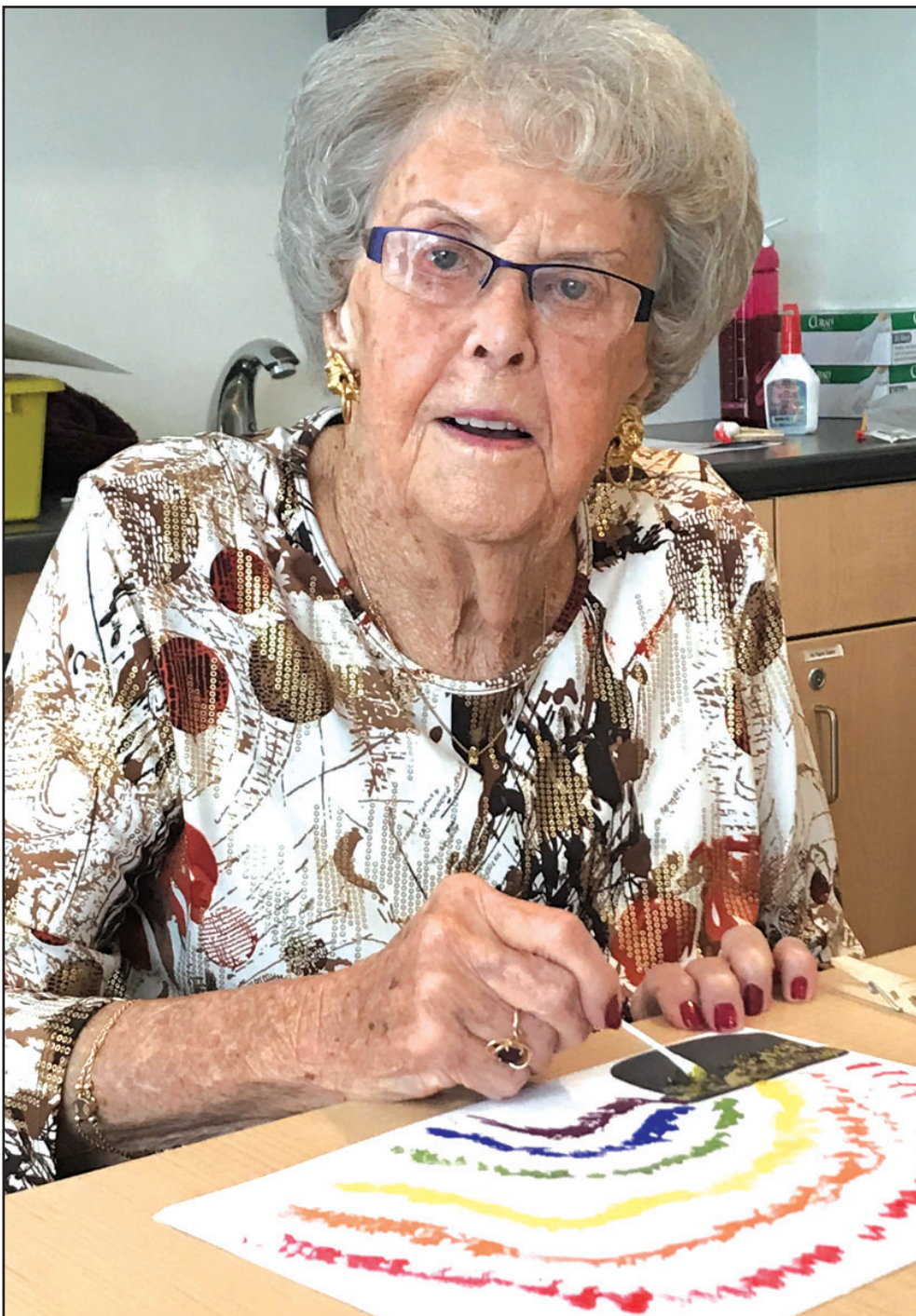
SUBMITTED BY ST. JOSEPH'S CARE GROUP

Daily or weekly activities include card games and bingo, religious services, and simple exercise groups, like tossing a ball around, balloon badminton or a walking group. Master gardeners visit year-round for indoor and out-